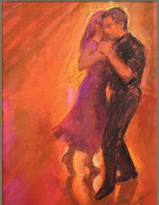
(RIGHT) KAREN HORNE (b. 1959), Tango Fire , 2017, pastel on La Carte panel, 16 x 12 in., Horne Fine Art, Salt Lake City