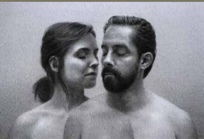
(CLOCKWISE FROM TOP LEFT) JULIE BELL (b. 1958), You and Me , 2015, oil on wood, 42 x 35 in., American Legacy Fine Arts (Pasadena) ■ STEPHANIE DESHPANDE (b. 1975), Conversations , 2019, oil on linen, 30 x 24 in., available through the artist ■ BRENDA BOYLAN (b. 1962), A Lite Lunch , 2016, pastel on paper, 9 x 12 in., Illume Gallery of Fine Art (St. George, Utah) ■ SARA GALLAGHER (b. 1990), Boundaries , 2020, graphite on paper, 4 x 6 in., private collection ■ DAVID TANNER (b. 1969), On the Mend , 2013, oil on canvas, 24 x 24 in., private collection