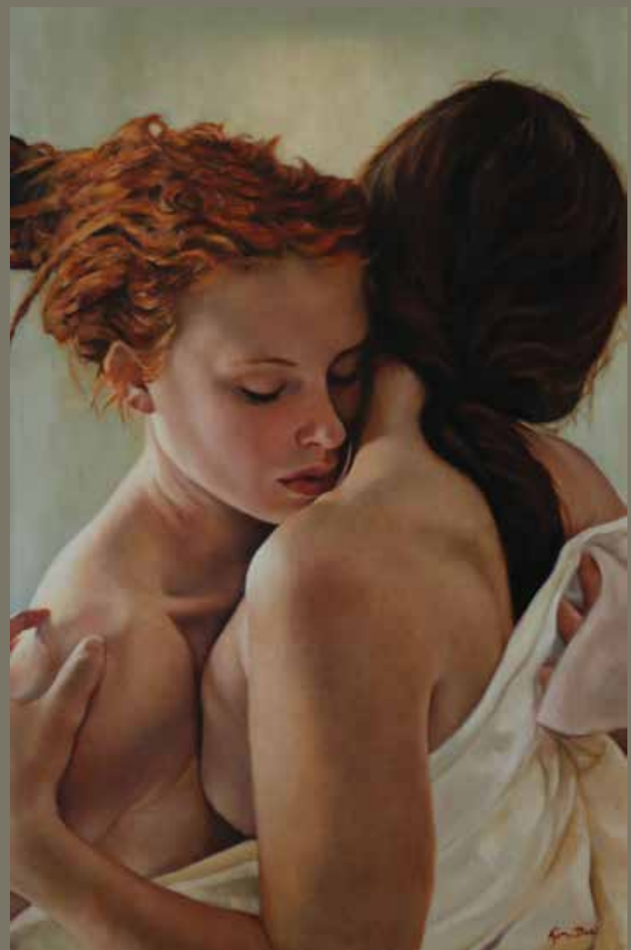
(ABOVE) JESSE LANE (b. 1990), Undercurrents , 2020, colored pencil on board, 26 x 39 in., RJD Gallery (Romeo, Michigan)