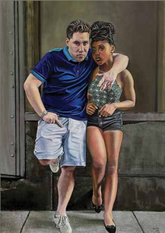
SEONA SOMMER (b. 1968), Bugsy H & SaSa , 2021, oil on canvas, 39 1/4 x 27 1/2 in., available through the artist