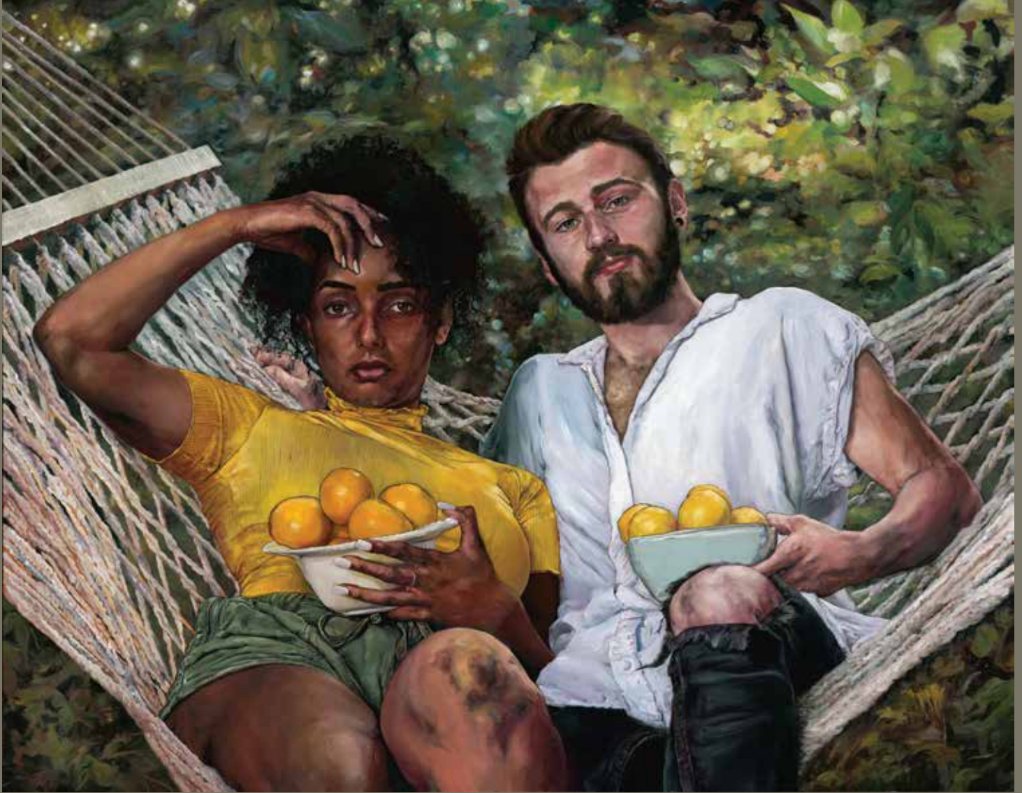
SHERRI WOLFGANG (b. 1961), Chelsea Morning , 2020, oil on linen, 48 x 60 in., Dacia Gallery (New York City)