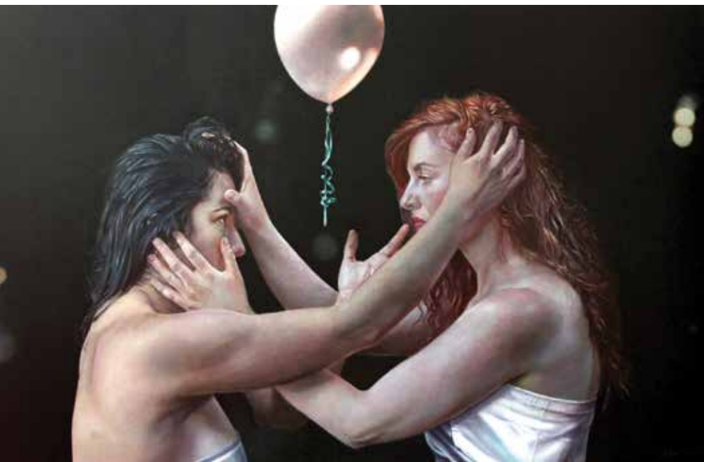
(CLOCKWISE FROM TOP LEFT) JOSEPH LORUSSO (b. 1966), Smooching on the C Train , 2017, oil on panel, 30 x 30 in., collection of the artist ■ DEBRA HUSE (b. 1959), Day Dream , 2020, oil on linen panel, 14 x 11 in., Huse Skelly Gallery (Newport Beach, California) ■ J. RUSSELL WELLS (b. 1954), It's Over , 2016, oil on canvas, 20 x 16 in., private collection ■ JACKIE EDWARDS (b. 1963), Solidarity , 2017, oil on linen mounted on wooden panel, 27 1/2 x 43 1/4 in., Gallery 1608 (Bushmills, Northern Ireland)