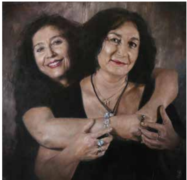
(LEFT) MATTHEW BIRD (b. 1977), Hidden Kiss , 2017, watercolor on paper on ACM panel, 30 x 14 in., available through the artist ■ (TOP) AIDA GARRITY (b. 1957), At the Museum , 2017, oil on linen, 24 x 18 in., available through the artist ■ (ABOVE) JAQ GRANTFORD (b. 1967), Sisters , 2019, oil on canvas, 36 1/4 x 36 1/4 in., private collection