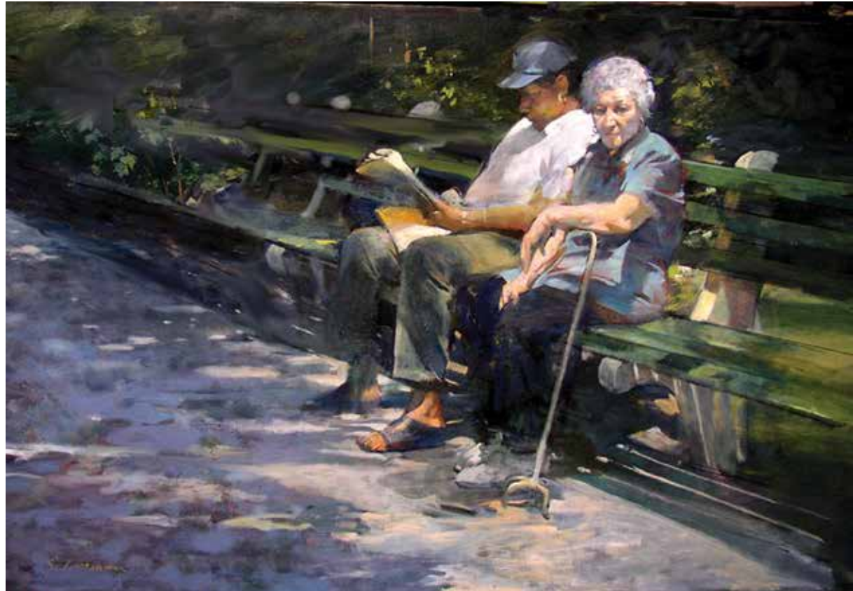
BURTON SILVERMAN (b. 1928), Park Bench , 2004, oil on linen, 32 x 50 in., private collection

Artists have long been intrigued by couples not only for their narrative potential (think Romeo and Juliet ), but also because the body language of people who are just that comfortable with each other differs noticeably from other pairs'. As inveterate observers, artists get interested when they discern that distinction, and so we are glad to illustrate here an array of recent images revealing the almost infinite possibilities this timeless motif can evoke. ●