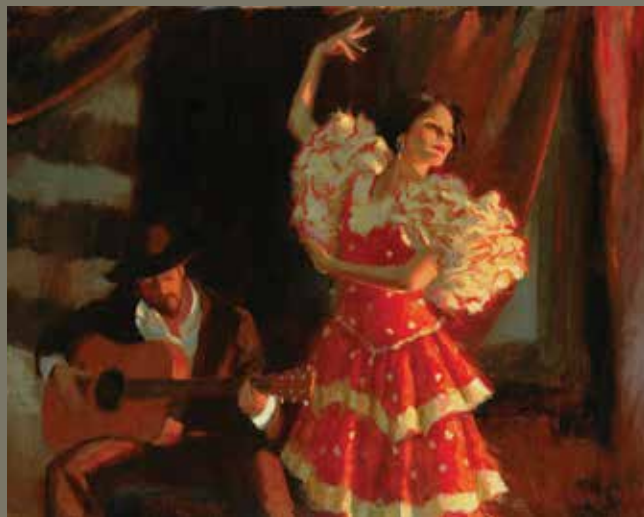
(ABOVE) CHRISTOPHER REMMERS (b. 1982), Internal Unity #1 , 2020, oil on linen, 52 x 52 in., private collection (to be exhibited at Versailles this October) ■ (FAR LEFT) GARY ALSUM (b. 1957), Sealed with a Kiss (maquette for a life-size private commission now in a Virginia Beach park), 2007, bronze on walnut and stone base, 19 x 19 x 12 in., available through the artist ■ (LEFT) WILLIAM A. SCHNEIDER (b. 1945), Olé , 2008, oil on linen, 24 x 30 in., private collection